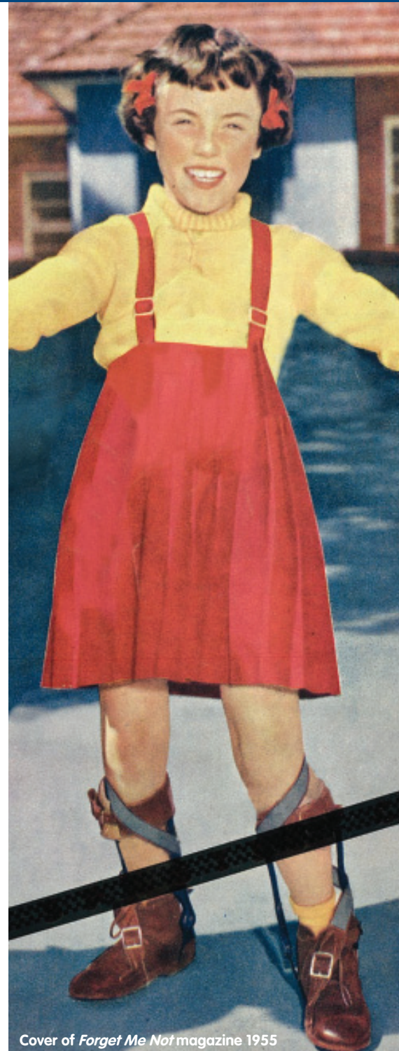
Cover of Forget Me Not magazine 1955

It is however each day, observing a sense, of joy, hope and achievement, in the eyes and actions of our clients that continues, and will continue as it has for 60 years, to inspired and motivate scosa .