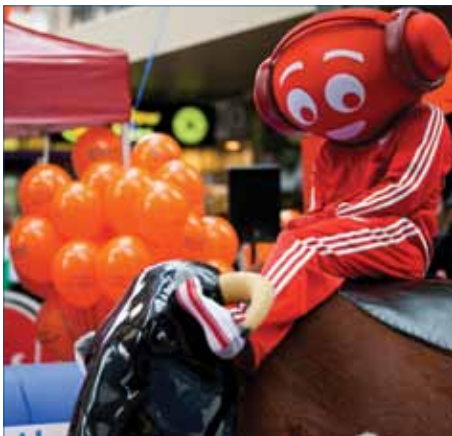
Nova Boy taking on the Mechanical Bull

We thank Adelaide Mechanical Bull Hire for lending us their bull, the ABC Learning Centres for their volunteering and everyone else who helped make the day possible.