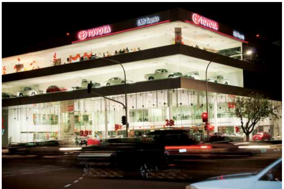
CMI Toyota, West Terrace - hosted our Sky-High Sensations Dinner