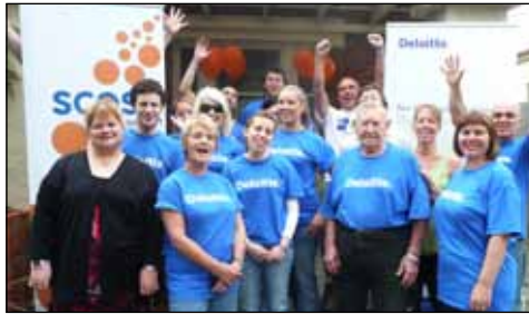
Deloitte volunteers at our Thebarton Hub

Ten Deloitte staff members turned up in force to our Thebarton Hub in November. They gave a new lease of life to the outdoor verandah area, painting and building while our staff and clients put on a scrumptious BBQ lunch to thank the volunteers for their valued efforts.