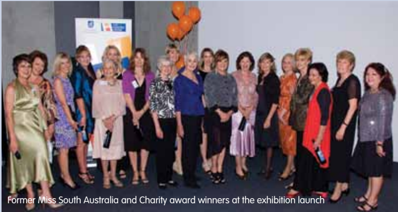
Former Miss South Australia and Charity award winners at the exhibition launch

'Having a Ball' featured on Channel 7's Today Tonight and Channel 9's Postcards programmes, delivering disability awareness into the homes of thousands. The exhibition was an opportunity to connect with our many supporters past and present and welcome them into our scosa family. In just two weeks we saw hundreds of visitors absorb our rich history of which we are so very proud.